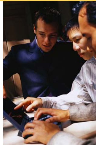
TryEngineering.org provides an opportunity to pose questions to engineer on all sorts of topics.

SAE International provides support to TryEngineering by managing the "Ask an Engineer" section. So, just click on "Ask an Engineer" at