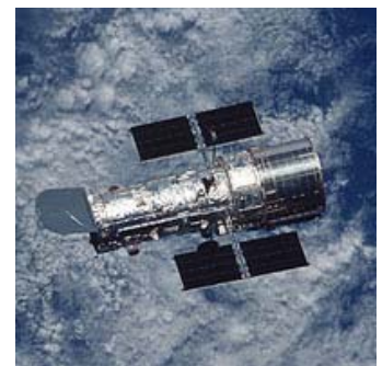
Hubble Floating Free

Herschel complements Hubble in the infrared part of the spectrum and is an ESA mission with NASA participation. Find out more at www.esa.int and www.nasa.gov .