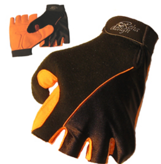
Gel-Palm Wheelchair Gloves

using unique materials. One glove incorporates gel padding to diminish impact force to the hand. Another uses a stretch neoprene backing for better traction. The company found that different materials provided unique benefits depending upon the needs of the wheelchair operator. Stretch neoprene, for example, worked well for wet weather and sports, when a sure grip is a must. More details are at www.newdisability.com .